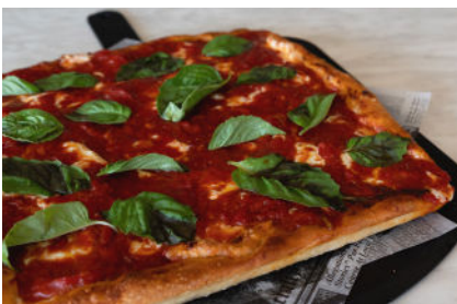
Grandma's thick crust, pizza sauce, fresh mozzarella, basil ... 23